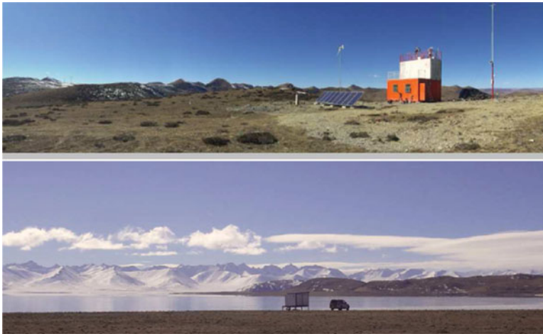
Figure 1. Top: The WMS (Daocheng) monitoring station located in western Sichuan. Bottom: The Namco monitoring station located in Tibet.