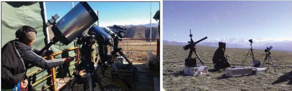
Figure 2. Professional site survey instruments after critical calibrations are used for the solar site survey.